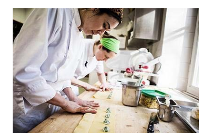
RSFP COMMUNITY LUNCH 1:00 p.m. Cortile McKim, Mead & White Building