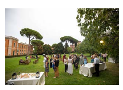
WELCOME RECEPTION 7:00 p.m. Bass Garden McKim, Mead & White Building Attire: Smart Casual