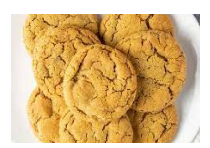
TEA AND COOKIES

The 2023 Rome Prize Winners and Italian Fellows in the Humanities will present 5-minute talks, highlighting their projects and what they've accomplished during their Fellowship year. This is the best intellectual channel-surfing you'll ever experience.