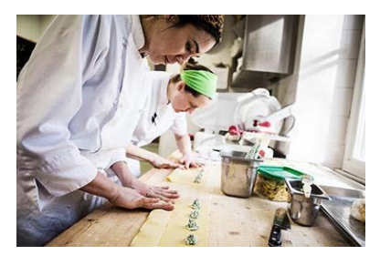
RSFP COMMUNITY LUNCH 1:00 p.m. Cortile McKim, Mead & White Building

time when the U.S. and Italy were undergoing profound change. Acknowledging their presence in Rome reminds us of the migratory histories that underpin Italy itself. This Walk will trace the presence of these individuals, and try to evoke another, more expansive, cartography of Rome.