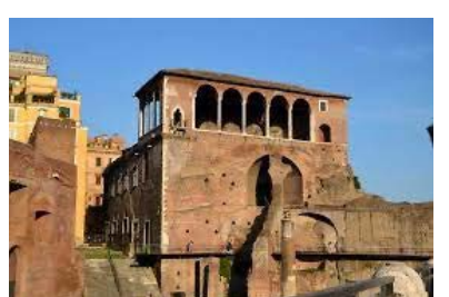
CASA DEI CAVALIERI DI RODI