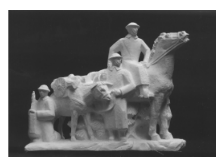
4 SOF NEWS Fall 2001

So I am grateful to all the Fellows, Residents, Trustees and Friends of the American Academy in Rome for your encouragement, participation, good wishes and support. You help to make all of this possible, not only for the Fellows of 2001-02 and the many whose lives they will touch through their work and lives this year, but also for the generations of artists and scholars to come who will find their world and lives forever enhanced by their time in Rome 🗃