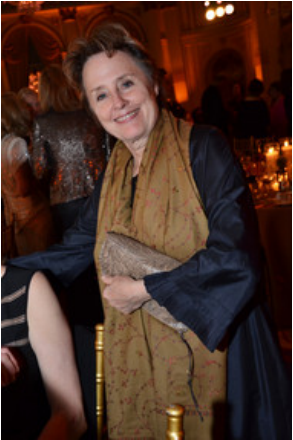
Alice Waters, owner of Chez Panisse and founder of the Edible Schoolyard.